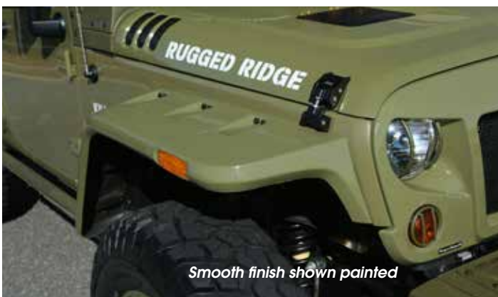
Smooth finish shown painted